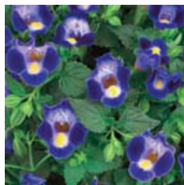
Catalina™ Midnight Blue