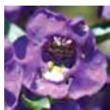
Angelface Blue (b):- A shimmering shade of blue-purple

Varieties Three, namely Blue, Pink and Sky Blue available in 2007, the other three in 2008