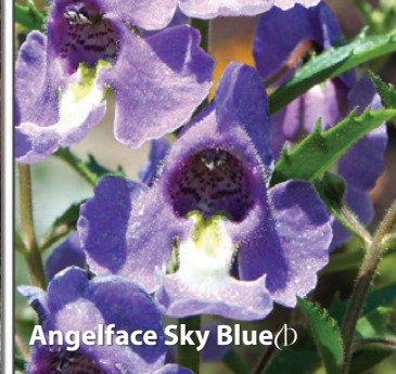
Angelface Sky Blue(1)

"A Better Garden Starts with a Better Plant"