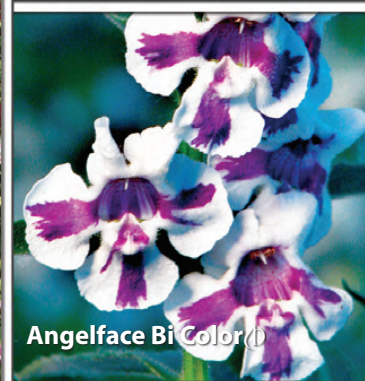
Angelface Bi Color(1)