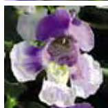
Angelface Wedgewood Blue (b):- The blue and white of the well known pottery.