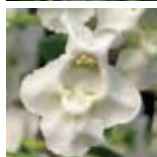
Angelface White (b):- Snowy white flowers.

Aussie Winners® Angelface Angelonias will be available from good garden centres. Look for them in the distinctive silver coloured pots printed with the AW logo. They are protected by Plant Breeders Rights.